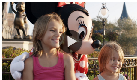
(click image for link to video)

Picrow is home to The Hall, but it's also home to a full production and editorial staff who are at the heart of every job—across the board, we are people who love what we do, care about each other, and deeply appreciate the work we get to make together. We're all connected here too!